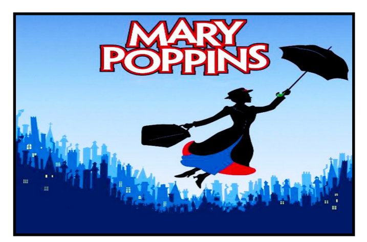
June 17, June 18, June 19

The jack-of-all trades, Bert, introduces us to the troubled Banks family. His children have sent many a nanny packing before Mary Poppins arrives on their doorstep. Using a combination of magic and common sense, she must teach the family how to value each other again.