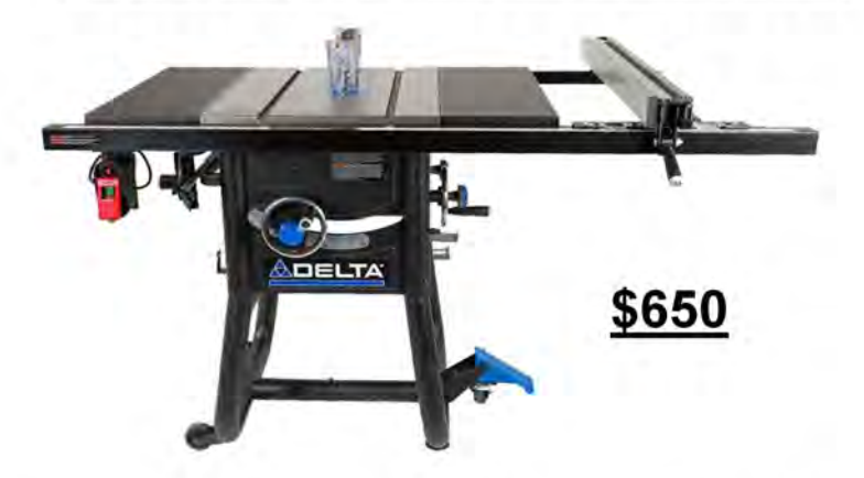
Table Saw for Set Construction

There are some items that are over and above our budget. Please visit our Wishlist Table in the lobby and give what you can!